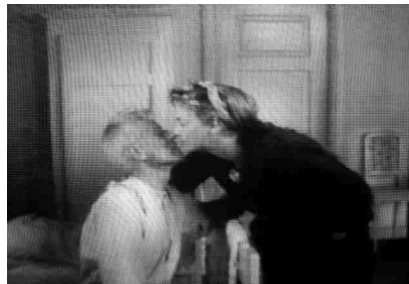
Mikkel and Inger

Imagine a family whose members are determinedly loyal to each other, in which the second son, although deemed to be off his rocker, is cared for in the bosom of the family, in which the prized possession is a pig and her 15 newly born piglets, and in which the centre of gravity is a woman of love and kindness, a daughter-in-law who has given herself wholly to the family into which she has wed. Her name is Inger.